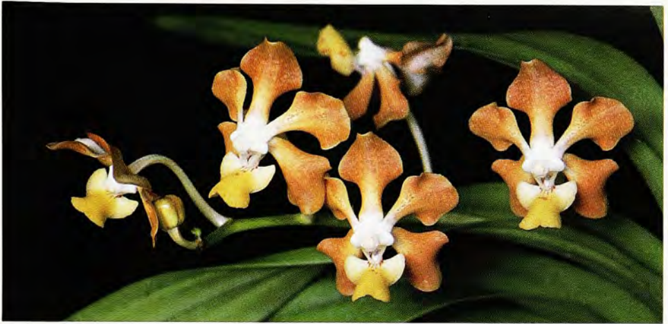
Producing flowers that range from clear yellow to tan, Vanda dearei from Borneo is a major source of yellow colors in our modern strap-leaf Vanda hybrids. However, it produces a small number of flowers on very large plants and lacks cold tolerance. The specimen shown here was grown by Motes Orchids.

be longer- and broader-leaved than other vandas. Even fifth- and sixth-generation hybrids usually can be distinguished from other vandas by an experienced eye.